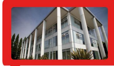
The Nowgen Centre