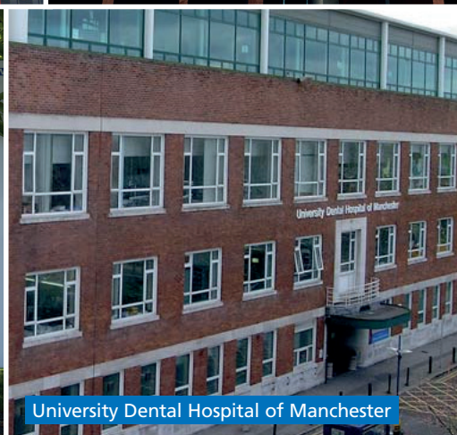
University Dental Hospital of Manchester