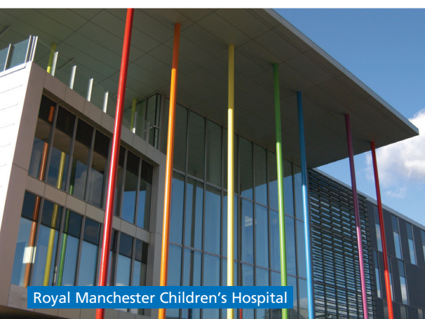
Royal Manchester Children's Hospital

We believe that good health services are vital to every local community and that our hospitals provide a modern, dependable, first-class healthcare service to the residents of Manchester, Trafford, Greater Manchester, and the North West that we can all be proud of.