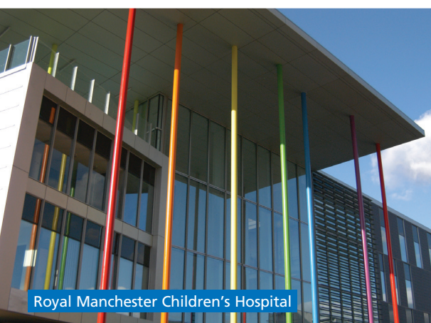
Royal Manchester Children's Hospital

We believe that good health services are vital to every local community and that our hospitals provide a modern, dependable, first-class healthcare service to the residents of Manchester, Trafford, Greater Manchester, and the North West that we can all be proud of.