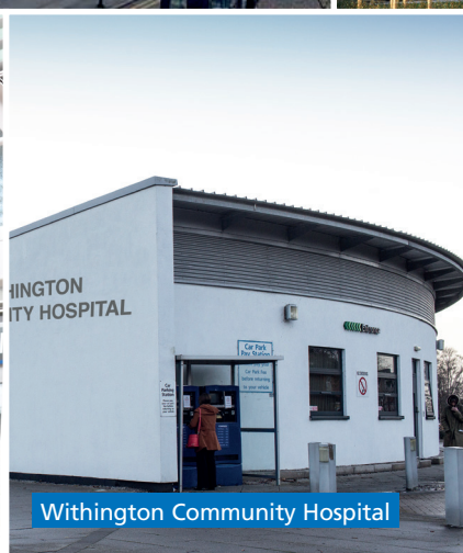
Withington Community Hospital