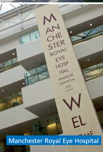
Manchester Royal Eye Hospital