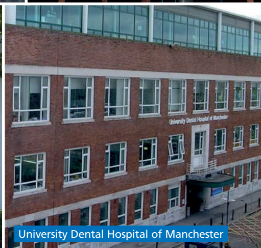
University Dental Hospital of Manchester