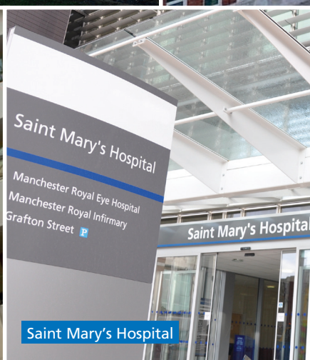
Saint Mary's Hospital