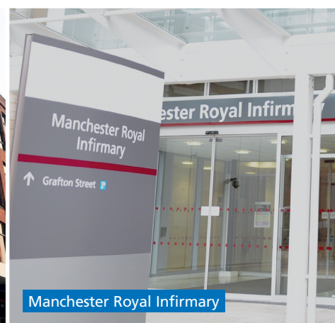
Manchester Royal Infirmary