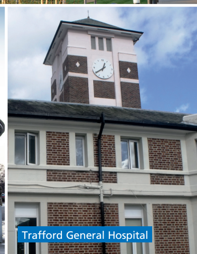
Trafford General Hospital