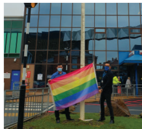
As part of LGBT+ History Month 2021, the Pride Flag was installed to the flagpole outside MRI for the entire month.