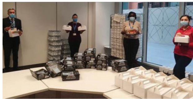
As part of Ramadan and Eid 2021, we shared vlogs from staff about what Ramadan means to them, and Iftar boxes were distributed to staff.