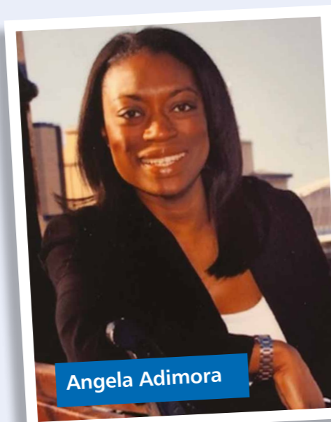
MFT's New Group Non-Executive Directors