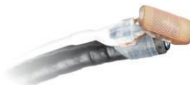
HALO 90 Device