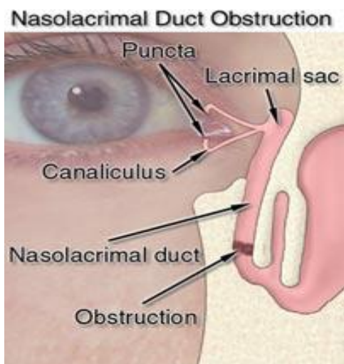
Diagram showing the drainage system of the eye