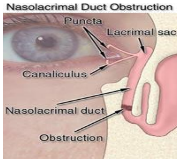
Diagram showing the drainage system of the eye