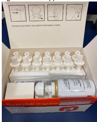
Fig 1 – Box as supplied