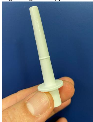
Fig 3- single use applicator