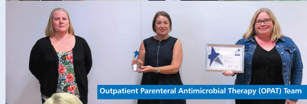
Outpatient Parenteral Antimicrobial Therapy (OPAT) Team