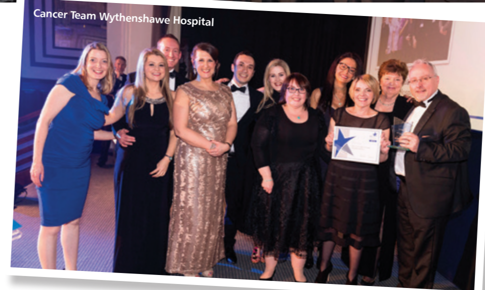
Cancer Team Wythenshawe Hospital