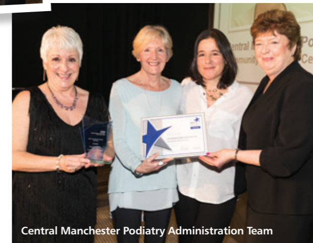
Central Manchester Podiatry Administration Team