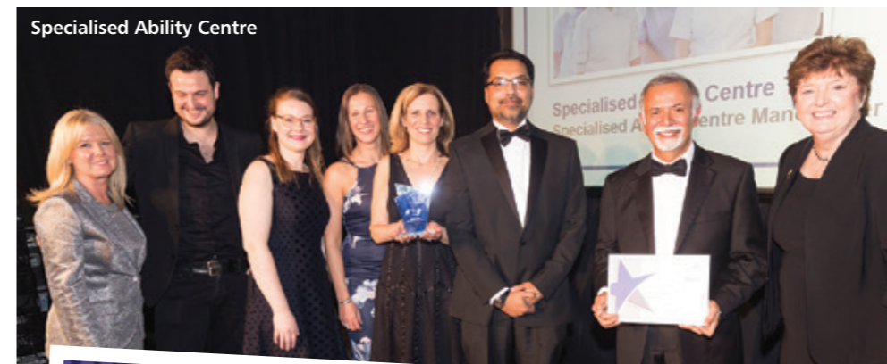
Specialised Ability Centre