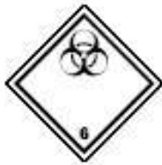
Figure 2. Danger sign for Infectious Substances