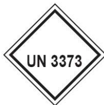
Figure 1. Hazard Label