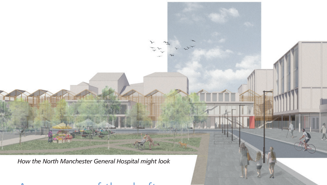
How the North Manchester General Hospital might look

A summary of the draft Strategic Regeneration Framework for public consultation