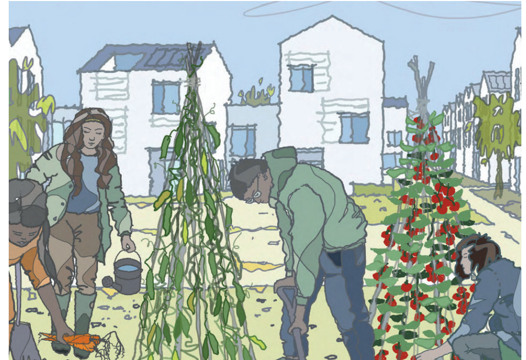
How the North Manchester General Hospital might look

A summary of the outcome of the consultation process will be presented to the Manchester City Council Executive Committee to consider before they give a final endorsement of the Strategic Regeneration Framework for North Manchester General Hospital.