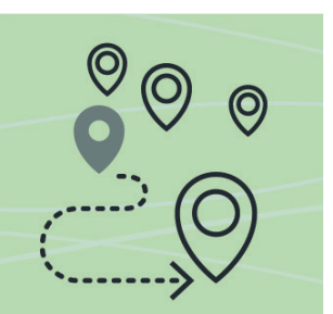
Promoting sustainable and healthy transport options