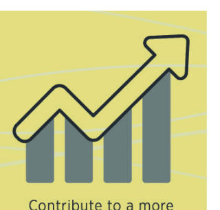
Contribute to a more inclusive North Manchester o economy

The redevelopment of the hospital is also a key part of growing the North Manchester economy and meeting many of the strategic objectives of the city.